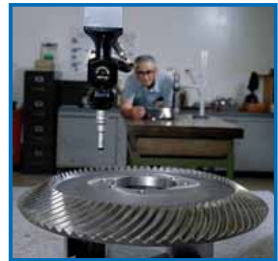
State-of-the-art testing equipment and comprehensive product testing ensures quality.