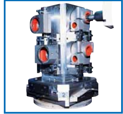
A multi-pallet machining center machines precisely and efficiently.