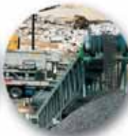
Stone & Aggregate